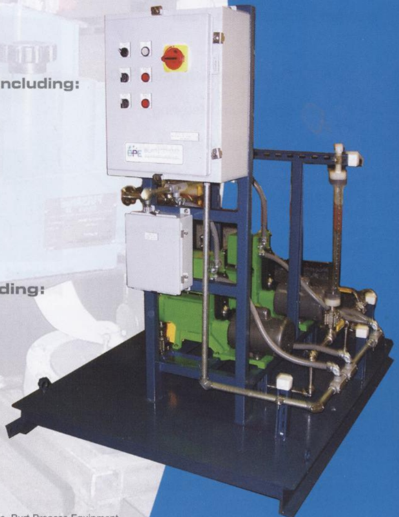
Industrial Wastewater Reagent Feed

The information in this document is subject to change without notice. Burt Process Equipment believes the information contained herein to be reliable, but makes no representations to its accuracy or completeness. Burt Process Equipment's sole and exclusive warranty is as stated in the Standard Terms and Conditions of Sale of these products. In no event is Burt Process liable for any indirect or consequential damages relating to the use of these products.